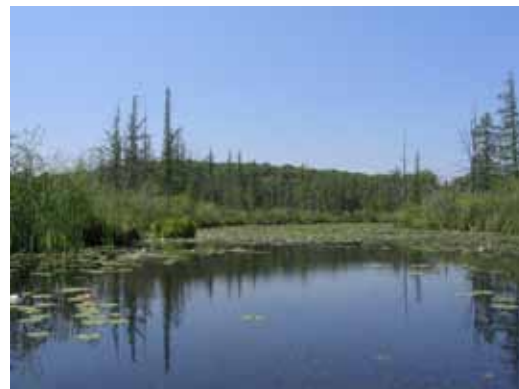
School Lake is one of six lakes being studied for a reduction in pollutants.

From 2002 to 2008, the Minnesota Pollution Control Agency (MPCA) listed the first five lakes as “impaired” for excess nutrients, meaning their nutrient levels exceed state standards for water quality.